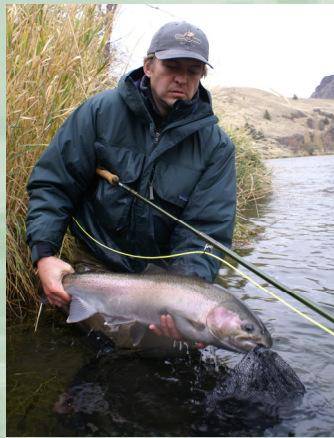
Two of the nicest Deschutes Steelhead I saw all year. Both caught on the last trip