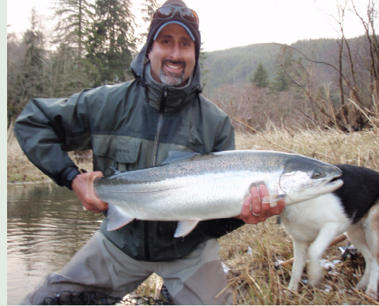
Fish like this can be the payoff for braving a cold day on the Oregon coast

ting it to hand provides a real challenge. A fierce fighter these fish will make repeated leaps, try to get under every obstacle in the river, and are capable of running long distances with bursts of speed of up to twenty-six miles per hour. Add into this the fact that these chrome rockets average around ten pounds with the occasional fish topping twenty and you can see why they are tops on many anglers lists.